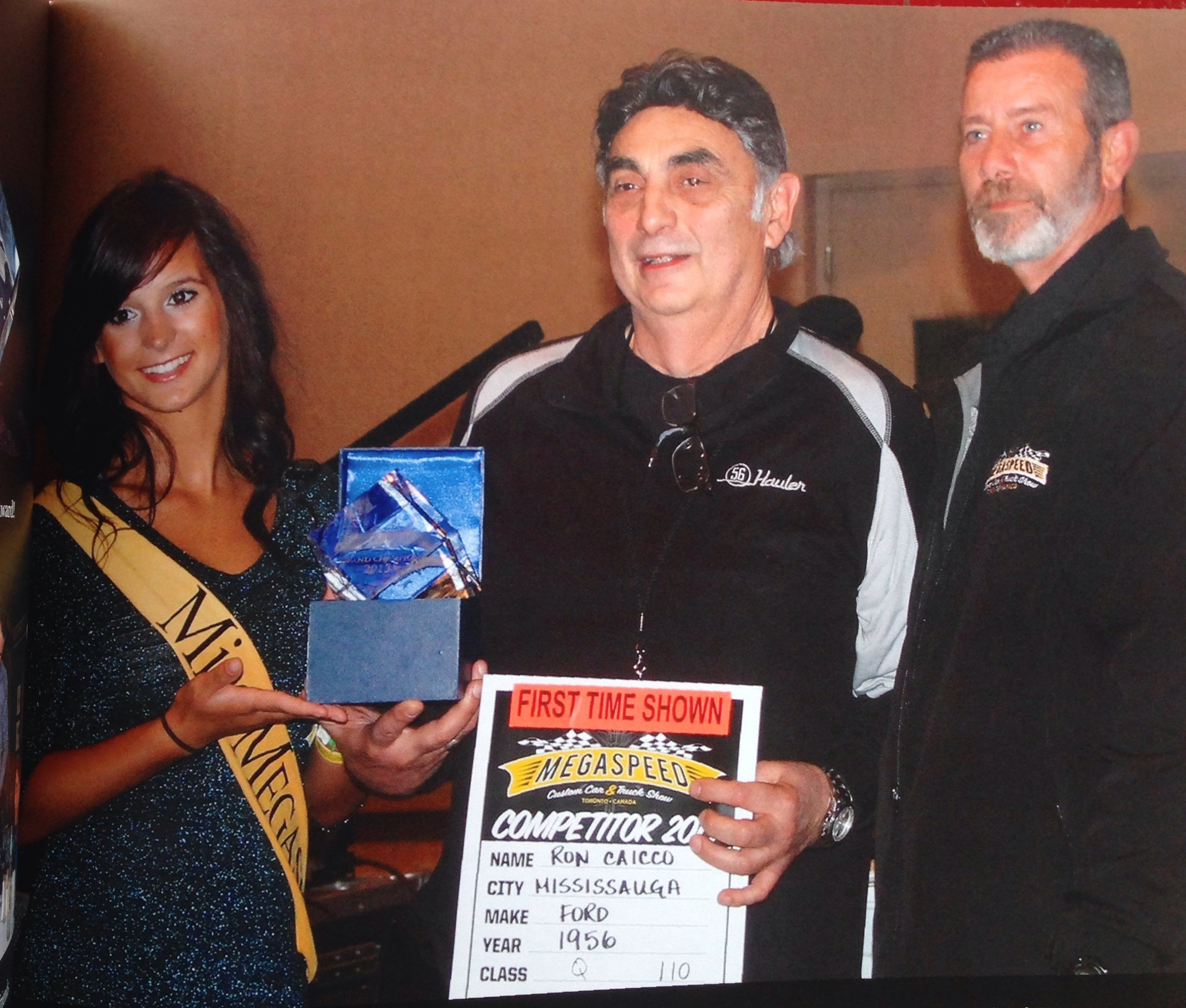
Megaspeed presentation images