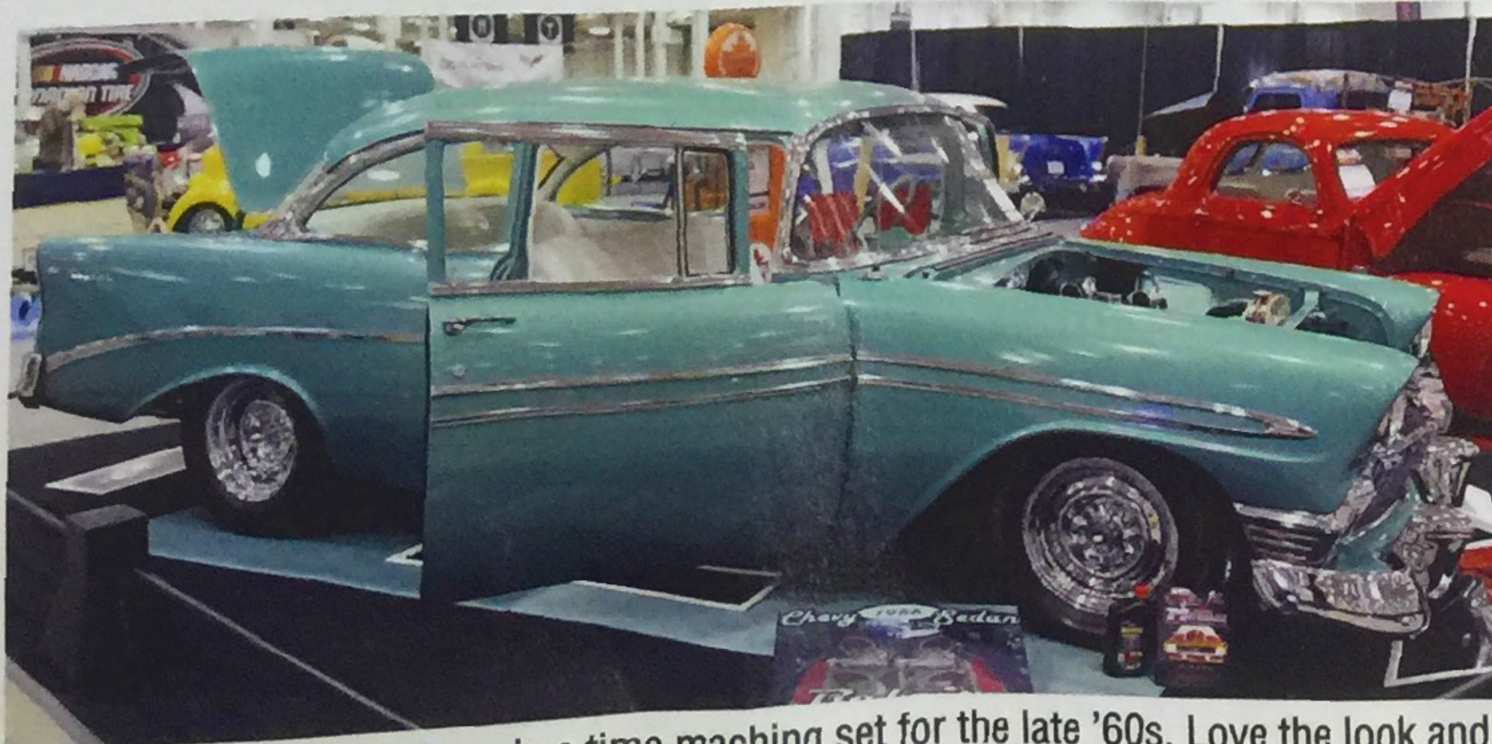
Jamie Hamilton's '56 Chevy is a time machine set for the late '60s. Love the look and the SBC with four carb intake and finned valves covers is engine bay jewelry.