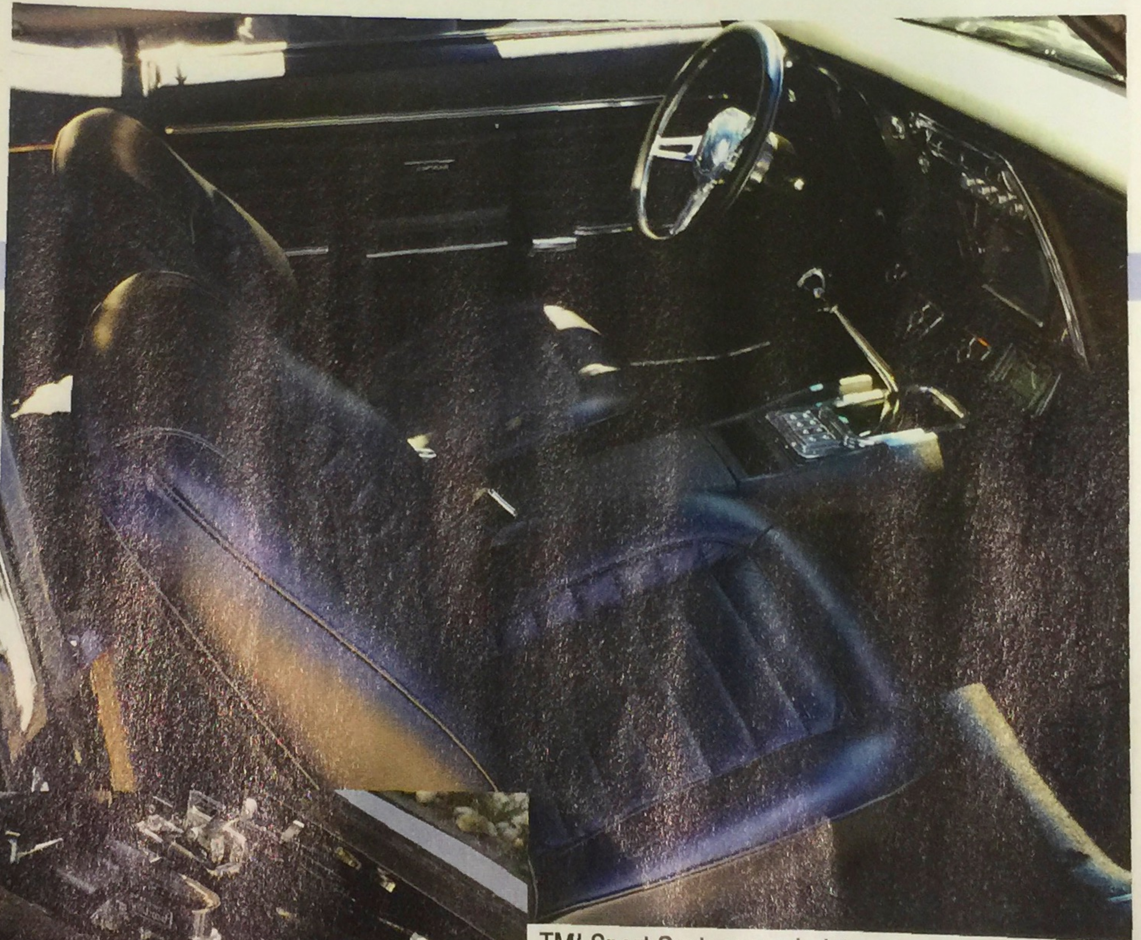
TMI Sport Seats are upholstered with black leather with carbon fibre console and dash. Car has A/C, a DVD and Navigation system.